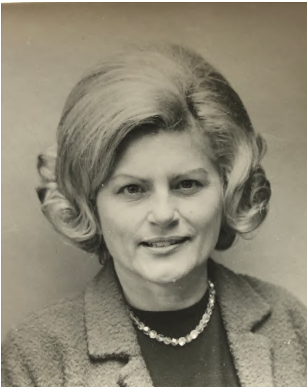
Submit your guess for the "Getting to Know Who?" Contest by March 4.